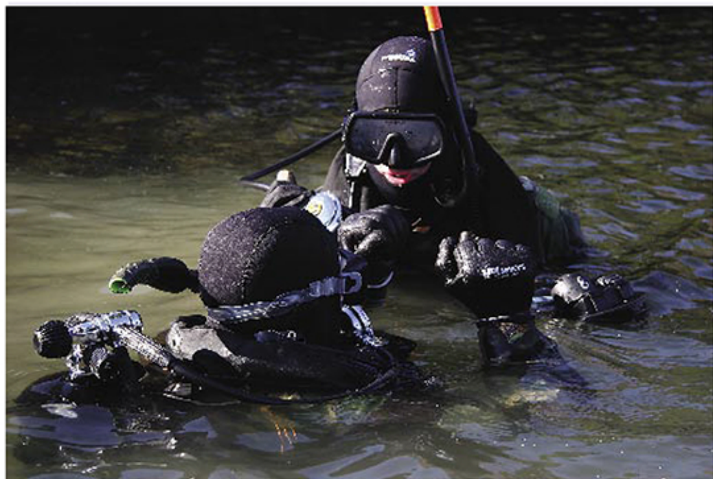
The Air Force's combat controllers and combat-rated divers learn scuba techniques as an infiltration tactic. Above and right, airmen of the 21st STS refresh their scuba skills. Occasional proficiency dives are required to ensure the airmen can dive and operate at depths of up to 130 feet.

These controllers had recently returned from a deployment to Iraq.